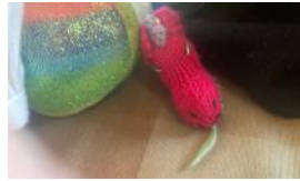
DRAGON REPRESENTS UPSTAIRS