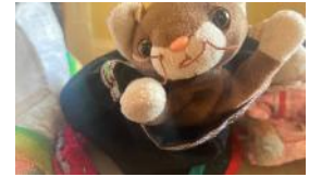
POUNCE REPRESENTS COFFEE TABLE