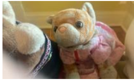
MEWNES REPRESENTS JAIL