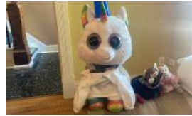
PIXY REPRESENTS HANNAH'S HOUSE